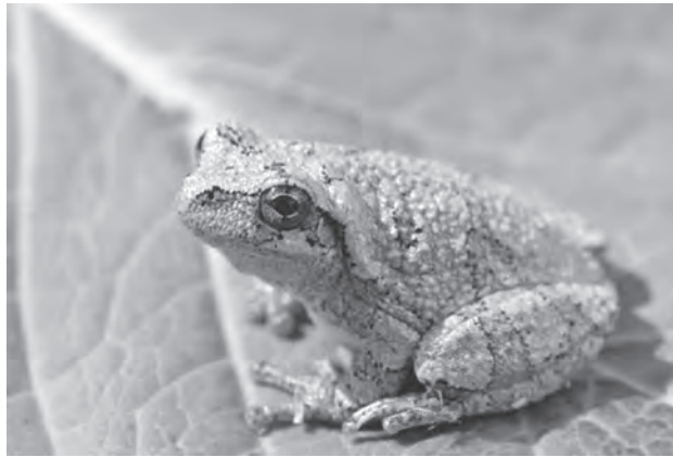
Magnification \times 1

The photograph below shows a grey tree frog.